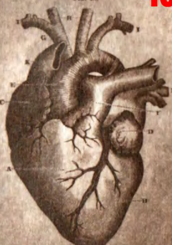
The heart. A, the right ventricle; B, the left ventricle; C, the right auricle; D, the left auricle.