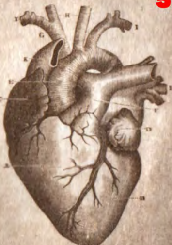
The heart. A, the right ventricle; B, the left ventricle; C, the right auricle; D, the left auricle.